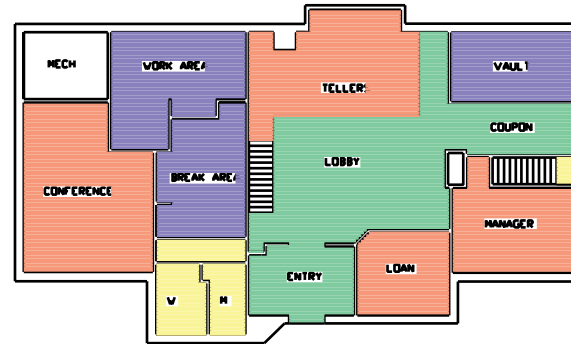
HINKLETOWN BRANCH OFFICE EXISTING FACILITY LAYOUT